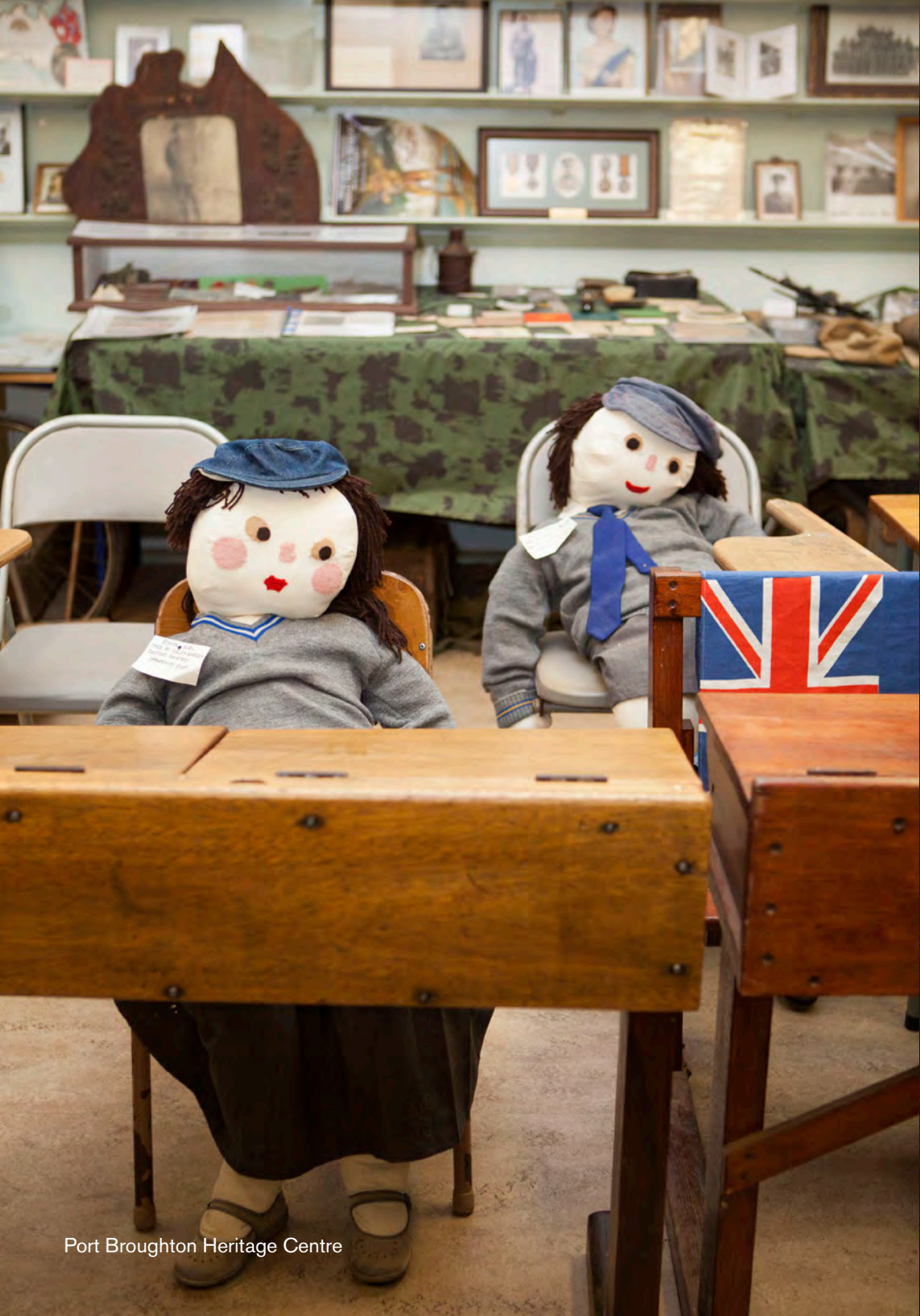
Port Broughton Heritage Centre