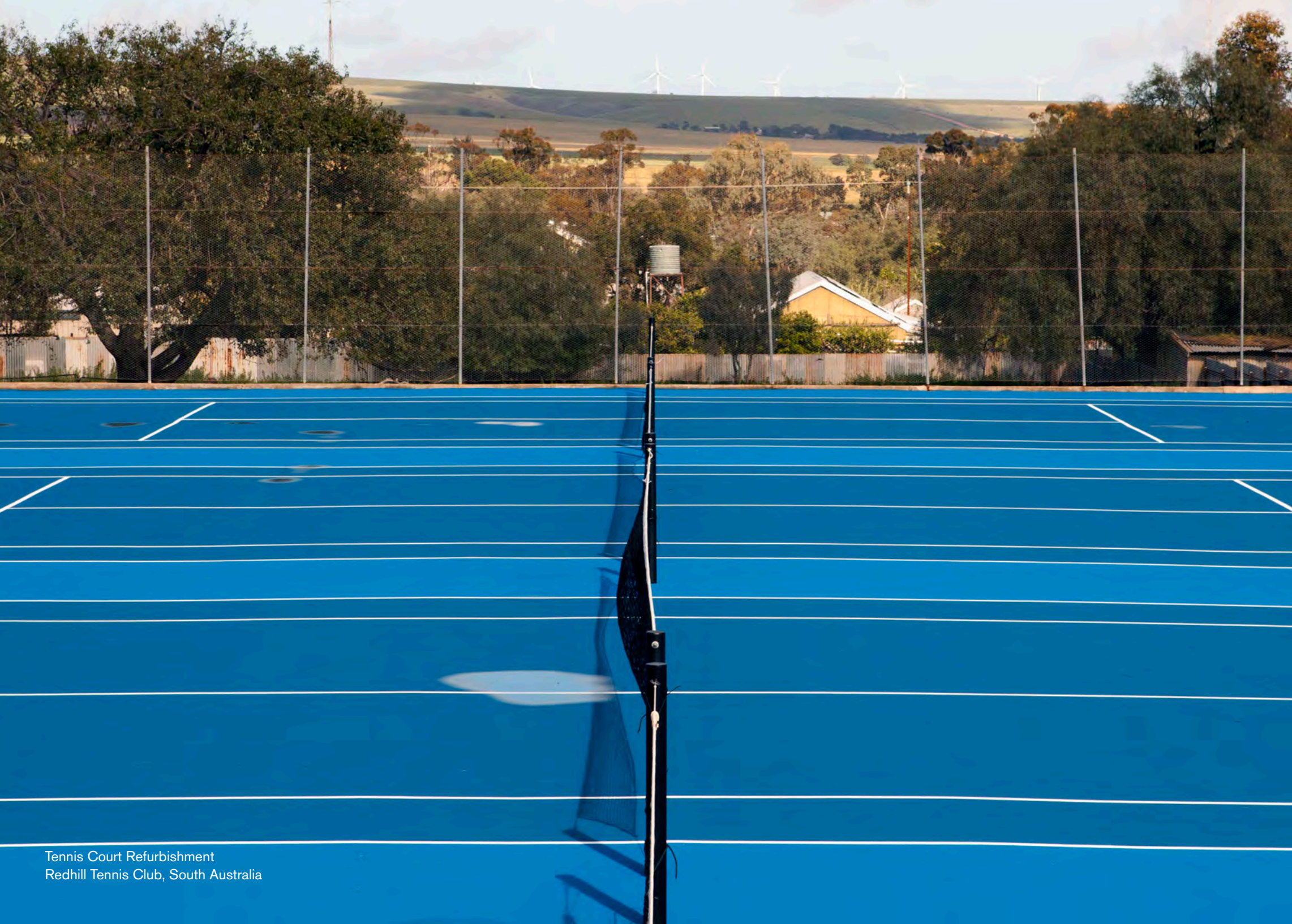
Tennis Court Refurbishment Redhill Tennis Club, South Australia