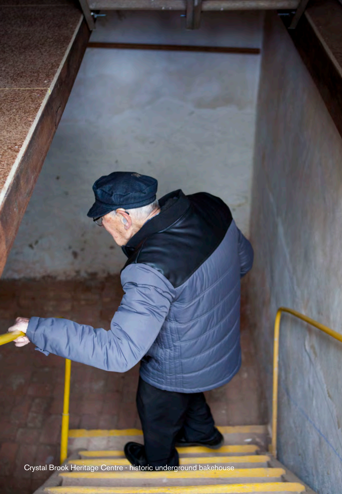
Crystal Brook Heritage Centre - historic underground bakehouse