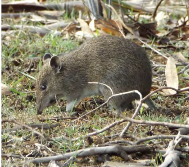
Images of foxes and the Southern Brown Bandicoot captured by the remote sensing cameras.

This simple project helped Basalt to Bay to save this iconic species from being another on the list of extinctions, and led to a range of positive local outcomes. It caught the attention of senior people in politics and government, unlocking grants and further support.