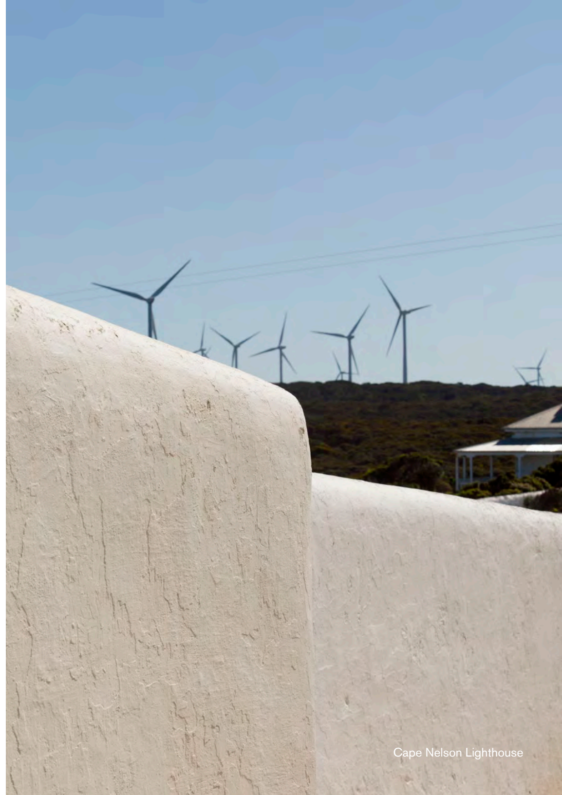
Cape Nelson Lighthouse