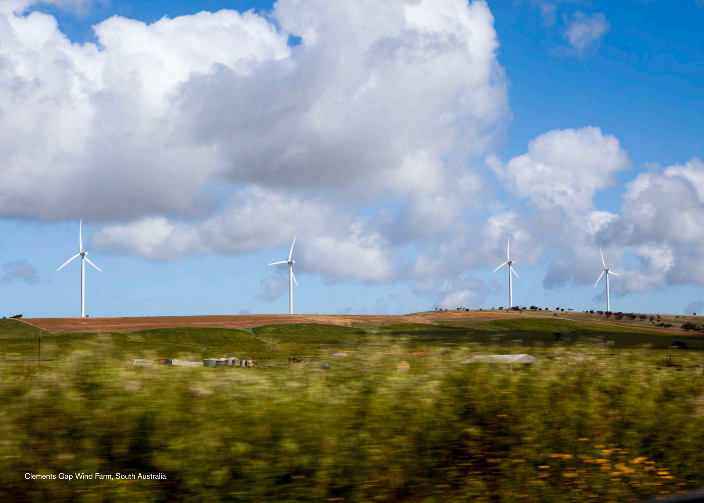
Clements Gap Wind Farm, South Australia